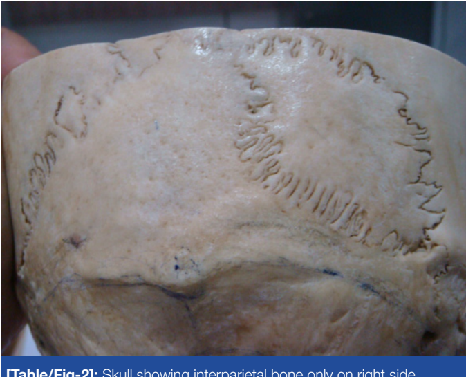
[Table/Fig-2]: Skull showing interparietal bone only on right side

In the present study, various types of additional bones were observed in the occipital region. Matsumura et al., [10] classified these bones into three types: the interparietal, pre-interparietal and the sutural bones. The interparietal (inca) bones have their lower